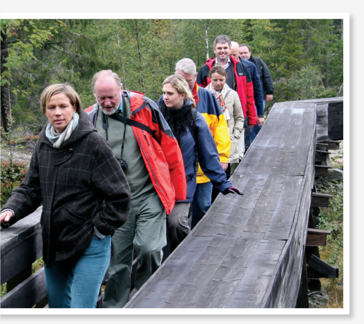
A walk in the mining district around Kongsberg