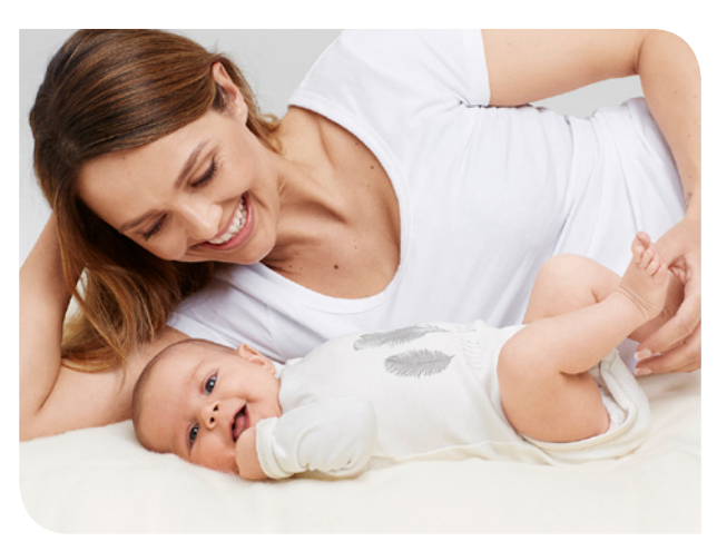
Cubus Nordic Swan Ecolabelled baby collection.

We sincerely hope so. Cubus has been making a great deal of green choices for a very long time, working with a substantial amount of Eco-Friendly cotton, BCI cotton etc. The Nordic Swan Ecolabel was an addition to and a way to highlight our sustainable effort, and we hope this will contribute to open the eyes of the customers on how we strive to do better for our planet.