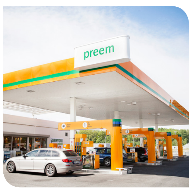
First Nordic Swan Ecolabelled liquid fuel in the world.

Absolutely, from both private consumers as well as our B2B customers. Most people want to choose what is best for the environment, and the Nordic Swan Ecolabel is instant proof of our product being the right choice. The Nordic Swan Ecolabel facilitates both for us and for our conscious customers.