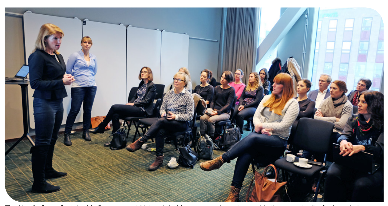
The Nordic Swan Sustainable Procurement Network holds many seminars to provide the opportunity for knowledge sharing on environmental and other sustainability issues.

The advertising campaign with the overriding message "Save the world a little every day" continued in Sweden, Norway and Finland. In Sweden there was an outdoor advertising in 34 cities at bus stops and underground stations, ads in major country-wide newspapers, followed by the digital campaign "The world's most important classroom" where celebrities gave a 3 minute speech in a classroom setting about what sustainability means to them. Ecolabelling Norway also ran an outdoor campaign in 40 cities and suburbs, digital ads at 55 shopping centres as well as ads in magazines and newspapers. In addition to this, the campaign provided