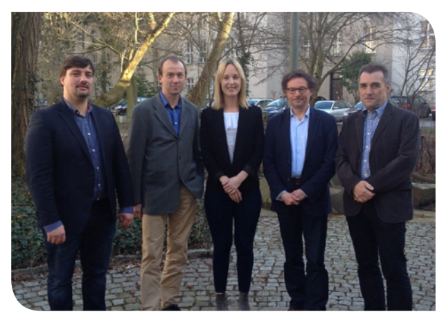
Nordic Ecolabelling in Berlin for a joint meeting with the Blue Angel.

In Denmark, the campaign "Your choice today makes a world of difference tomorrow" ran twice in February and October. The green shopping basket, which has