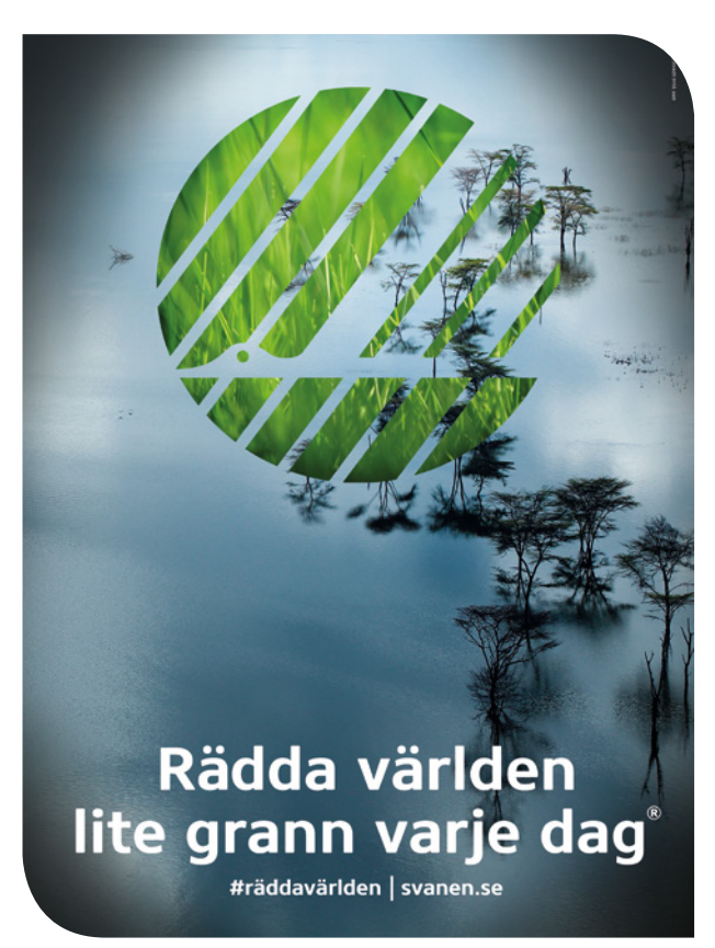
Swedish consumer campaign "Save the world a little bit every day"

become a strong symbol of consumer empowerment and environmentally friendly choices, were widely shown on national outdoor advertising, print ads in newspapers and magazines and online banners. Social media activation ensured high level of engagement from consumers. A majority of Danish supermarket chains participated in the two campaigns with offers on ecolabelled products and visibility in store, in trade papers and social media. Both campaigns were supported by extensive PR activation, which resulted in more than 160 press clippings from licensees, retail, stakeholders, authorities and national news media. Follow-up consumer research showed both a significant increase in unaided awareness of the Nordic Swan Ecolabel, and an increase in share of consumers looking for the Nordic Swan Ecolabel when purchasing. Awareness of the EU-Ecolabel grew from 38% (2015) to 44% (end of 2016).