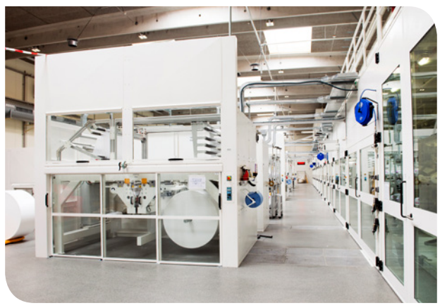
Abena's production plant.

There is also the task of making international customers understand what the Nordic Swan Ecolabel actually represents. We think that this is a story that needs telling and we would like to work alongside Nordic Ecolabelling to help improve this knowledge. Greater international focus is required. The label needs to be recognized outside the Nordic region and its value needs to be clear.