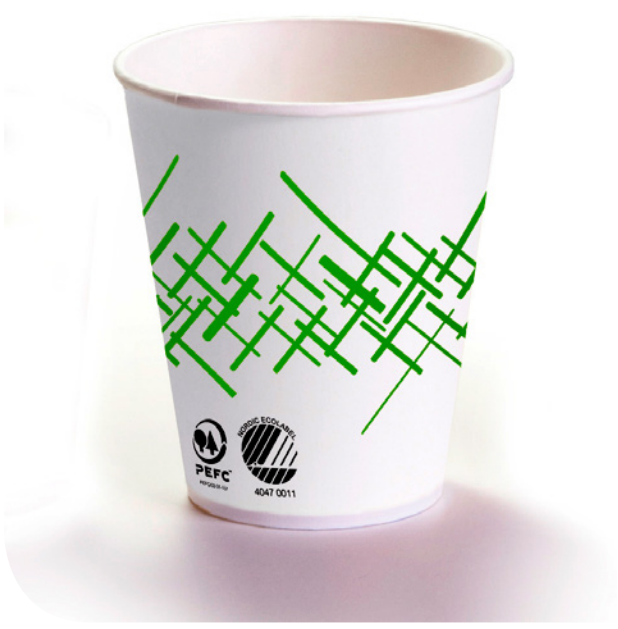
Huhtamäki's Nordic Swan Ecolabelled cup.

As the Nordic Swan Ecolabel is a well-known and trusted ecolabel, we believe it has a positive impact on end users. As a visual element on a product the Swan logo makes sustainable choice easier. This is one of the key benefits we offer to our customers.