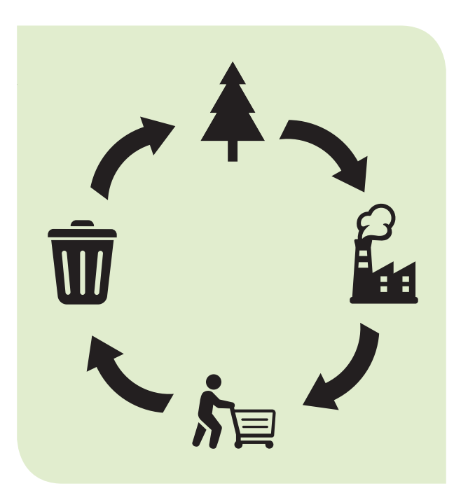
All Nordic Ecolabelling's criteria are rooted in a life cycle perspective.

New chemicals that are harmful to human health and the environment are constantly being discovered. At the same time, we still lack sufficient knowledge to be able to identify which particular characteristics of these chemicals and pollutants are having a harmful effect on our health and the environment. The effects are therefore difficult to assess. The majority of substances harmful to the environment being discovered today, are substances that break down slowly and are therefore found in the environment, foodstuffs and also in our bodies. Point sources of pollution, where chemicals are emitted in a more or less controlled manner, have been remedied over time. The most important source today