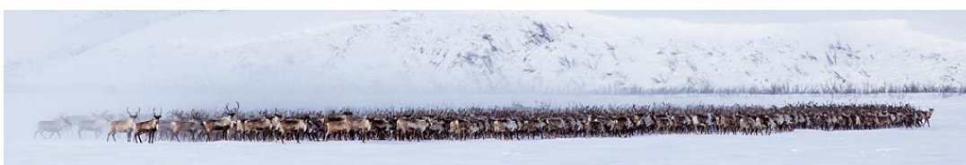
Pic: Canadian Reindeer Herd.

There has been good progress on outreach activities, and especially so regarding ReindeerPortal.org and the UEI Training of Future Arctic Leaders program. The GEF/ UNEP Nomadic Herders has had very good progress, conditions taken into account.