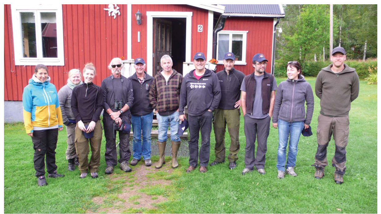
Picture. Field excursion to Dalarna, Sweden, the main study area for brown bear in Scandinavia.

• 31. August - 1. September 2015. Excursion. We initiated our CAS-year with a field trip to Dalarna in Sweden from where the main bear data derive. This was important to get an overview for all participants of the main ongoing activities, but also in order to let people meet in a relaxed setting to get to know each other. For this trip, we invited Prof. Joel Berger from USA, as he is a person with lots of ideas and useful for brainstorming in initial stages of the project. The stay at the field station included an overview of the research activity of the bear project, as well as presentations of the attendees. For the 2<sup>nd</sup> day, we visited a bear den to get a view of the typical habitat for brown bear.